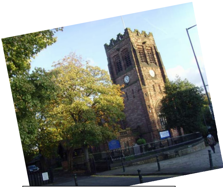
ST. PETER NEWTON IN MAKERFIELD