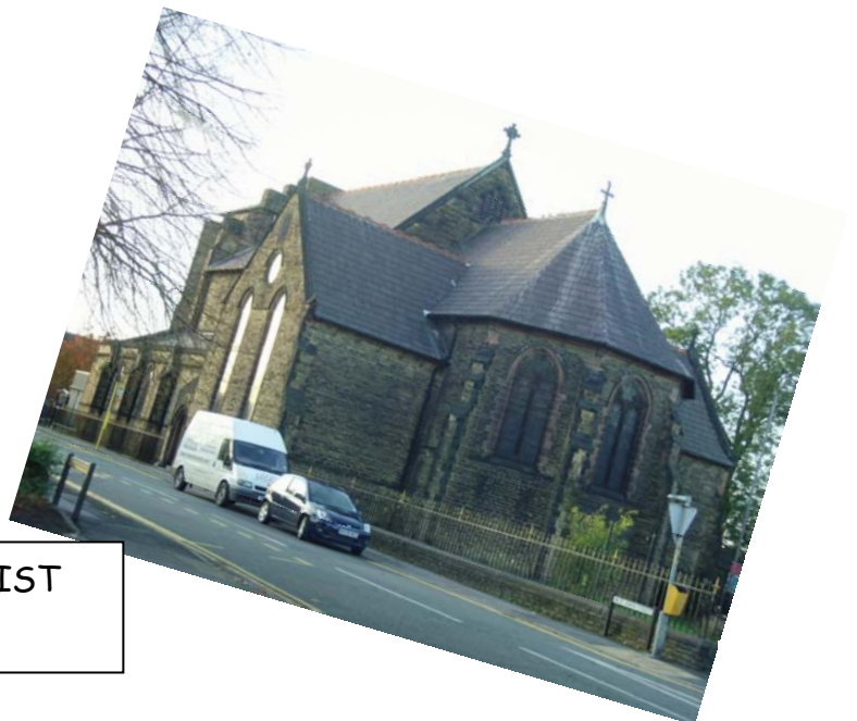
ST. JOHN THE BAPTIST EARLESTOWN